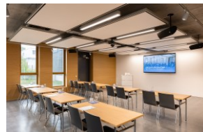
AIRWORKER Academy

The AIRWORKER Academy also offers individual training programmes for five or more participants.